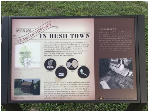
Exhibit Panel at Museum on Old Baltimore

It has taken longer than expected, but the Museum at the Historical Society of Harford County is finally coming together.