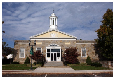
The Historical Society of Harford County, Inc., headquarters.