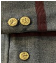
Brass Buttons & Maroon Trim

We discovered that the jacket hadn't yet been accessioned, so we opened it out on our table and began looking at its design elements. The waist-length jacket in the Eisenhower style is made of blue-gray (formally known as Cadet Gray) wool gabardine with a deep pile lining in dark blue. The Eisenhower style, based on the WWII U.S. Army jacket named after Dwight D. Eisenhower, was officially added to the Letter Carrier's uniform in 1955.