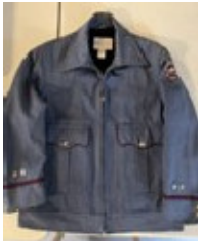
USPS Cold Weather Jacket

A few months ago, we examined and accessioned a United States Postal Service Letter Carrier's cold weather jacket. It may seem like a boring bit of clothing when compared to an 1890s asymmetrical bustle dress, but this particular jacket brightened our workday. It belonged to a Harford County Letter Carrier and had been on display at Society headquarters for a few years before being packed away due to construction on the new museum. As often happens in life, it turned up during a search for something quite different.