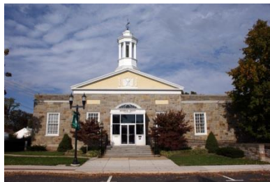
The Historical Society of Harford County, Inc., headquarters.