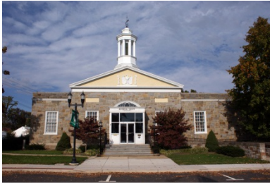
The Historical Society of Harford County, Inc., headquarters.