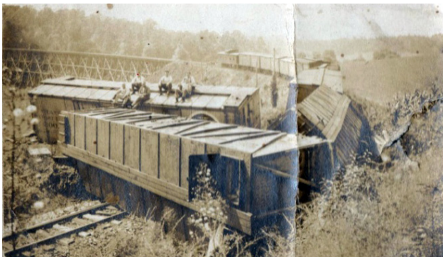
The above is a wreck at Gross trestle in 1920.